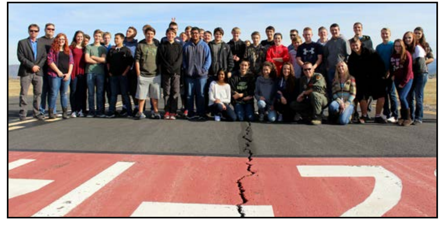
Top: Henley High School engineering students watch F-15 Eagles take off at Kingsley Field, home of the Oregon Air National Guard's 173rd Fighter Wing.

Bottom: About Forty Students from Henley High School's new Aerospace Engineering Program visited the 173rd Fighter Wing to witness how engineering principles are applied in the real world.